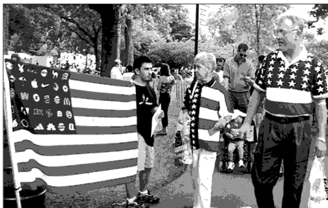
'Corporate American Flag' logo and photo courtesy adbusters.org

A rebellion is building. Thousands of protesters shake up every global trade conference with calls for less corporate clout and more grassroots power. Now activists have set a date to mark that spirit of resistance -- July 4, Independence Day. This year's Flag Jam was a blast of symbolic disobedience to get America (and the rest of the world) thinking about the meaning of its original revolution, and its subservience to corporations today. What counts as 'independence'? And when will we win it back?